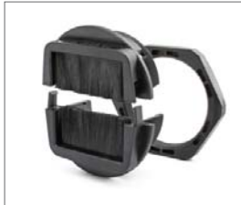
Round version with M50 thread for locknut or snap-in mounting.