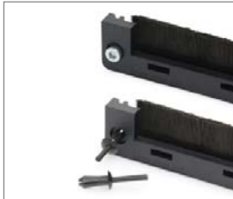
Screw mounting or mounting via expanding rivets possible.